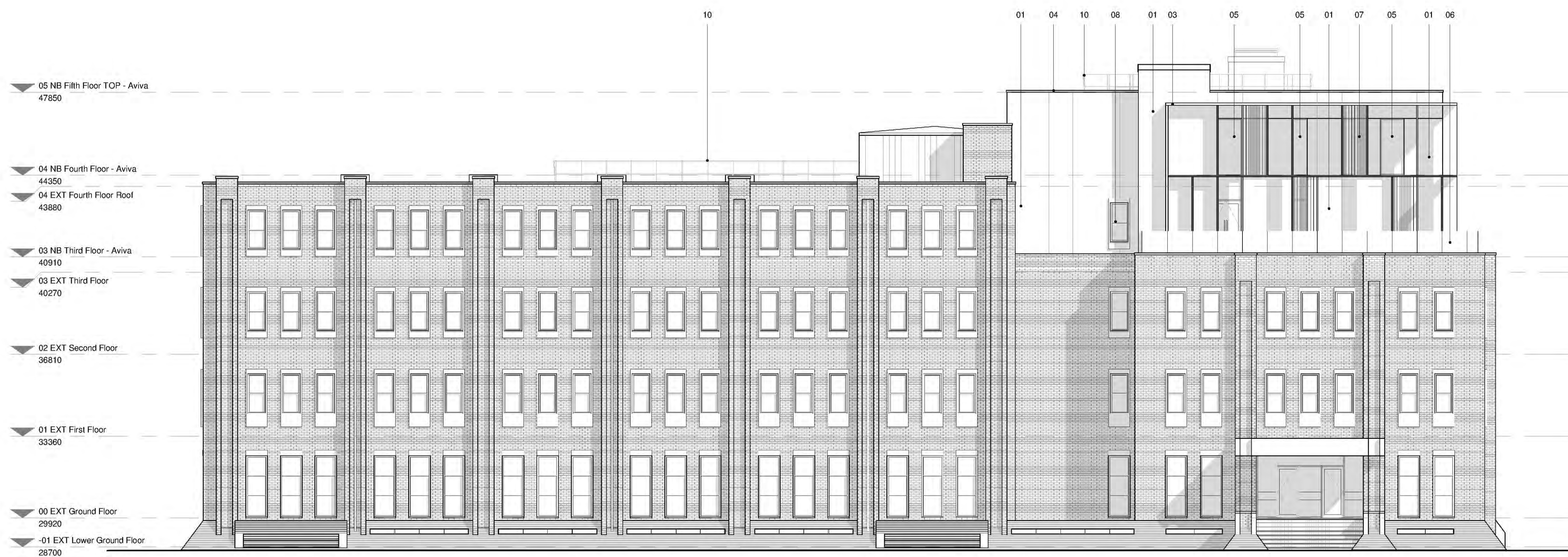
Proposed West Elevation NB.1 1 : 100